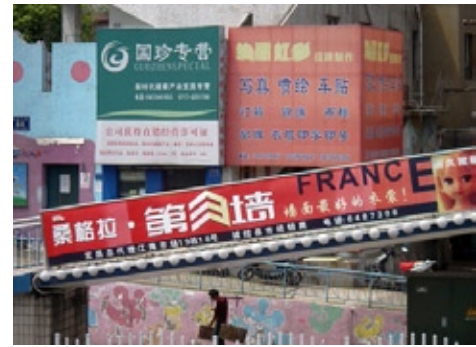
No Title - Photograph, 2008